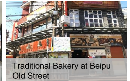
Traditional Bakery at Beipu Old Street