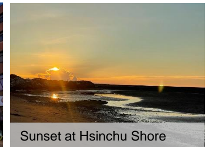
Sunset at Hsinchu Shore