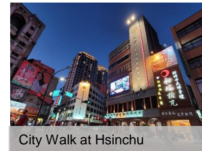
City Walk at Hsinchu