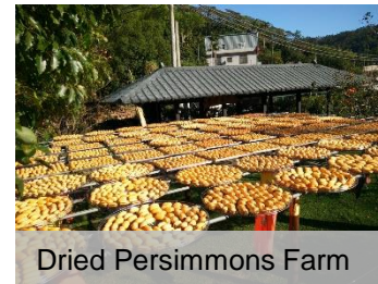
Dried Persimmons Farm